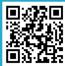
FOR BIOS SCAN QR voiceless.com/playbill